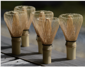
Traditional handcraft, Takayama Chasen bamboo tea whisk