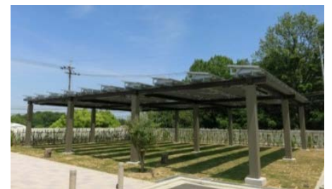
Solar power equipment (17.1 kW) over regulating reservoir (common area)