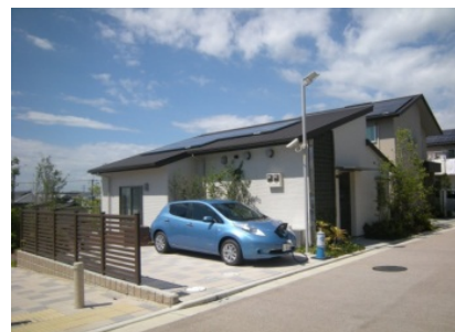
EV car sharing at community hall