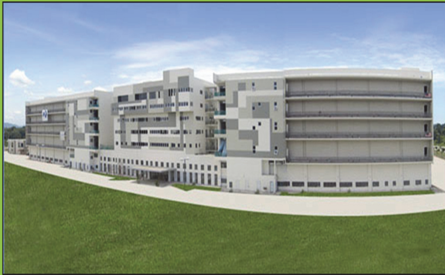
1 st Green Data Centre