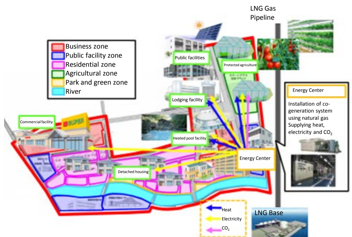
Conceptual diagram of town planning and local energy project around Shinchi Station

With the natural gas branching off from the pipeline to be installed on the east side of the station area, the aim is for commercialization of an autonomous and distributed local energy system using a co-generation system that supplies heat and electricity to nearby facilities, as well as a tri-generation system to supply CO 2 to agricultural production facilities.