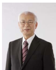
Mr. Tsuneaki Iguchi Mayor, Iwanuma City