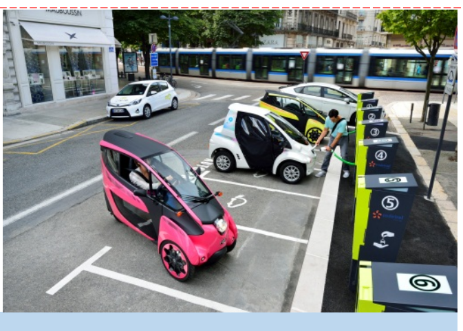
Ha:mo station in Grenoble, France

<u>Ultra-compact EV sharing system, Ha:mo</u>